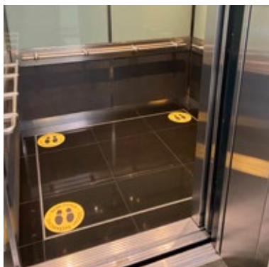
Social distancing in elevators