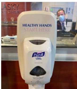
Hand sanitizer dispensers